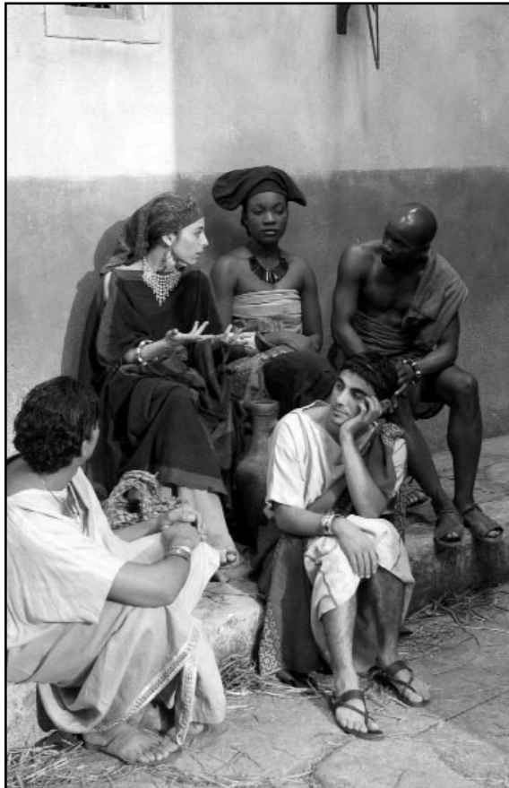
People in Pompeii do not realise it is their last day