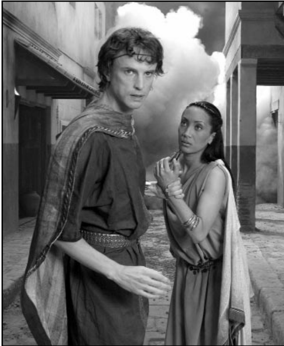
The volcanic surge reaches Pompeii as Stephanus remains defiant

the danger of living in its shadow. With no word in Latin for volcano, they might have thought the eruption was a message from the Gods. Pompeii – The Last Day is their story.