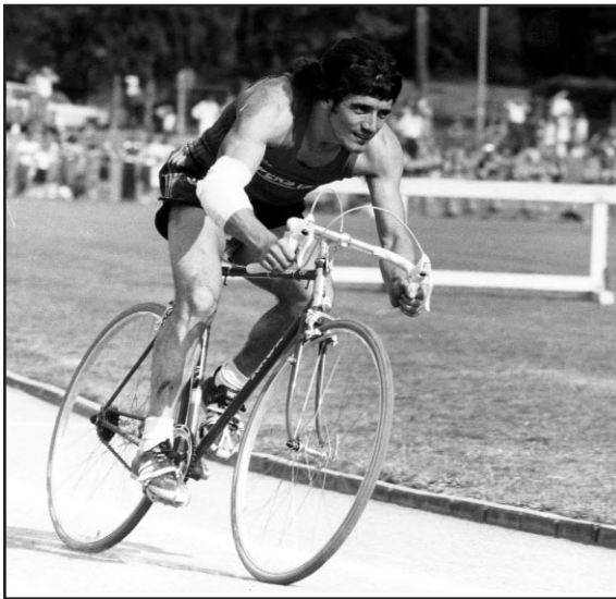
Kevin Keegan gets on his bike

Kevin Keegan came off his bike on a cinder track, and most of the skin came off his back and arms. Keegan was racing against the Belgian football captain. They both went off at a cracking speed but, suddenly, Keegan's bike touched the back wheel of his opponent's on the first bend and he came off, sliding across the track for what seemed like an eternity. Keegan wasn't worried as he was the only man in the stadium who couldn't see his back. He raced again, won, then went on to win the steeplechase and the whole event. Literally from the ashes, Keegan was champion.