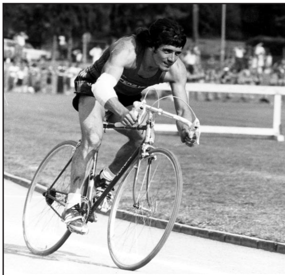
Kevin Keegan gets on his bike

Kevin Keegan came off his bike on a cinder track, and most of the skin came off his back and arms. Keegan was racing against the Belgian football captain. They both went off at a cracking speed but, suddenly, Keegan's bike touched the back wheel of his opponent's on the first bend and he came off, sliding across the track for what seemed like an eternity. Keegan wasn't worried as he was the only man in the stadium who couldn't see his back. He raced again, won, then went on to win the steeplechase and the whole event. Literally from the ashes, Keegan was champion.